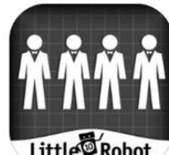
Operation Math Code Squad £2.99 (iOS) £2.69 (Google)